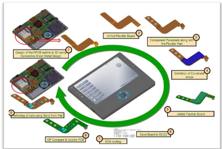
Fig 1 :End to end Process Coverage

These reasons make Flexible PCBs suitable for use in almost all electronics-based equipment, from hot consumer products such as digital cameras, computers and hard drives, to internal medical devices and military equipment. Thanks to flexible PCBs, we have seen generations of notebooks, tablet computers and myriad other devices reduce in weight over the last 5 or 6 years, while their features and functions have increased dramatically. Whatever the industry or the type of electronic product is the chance of encountering flexible PCBs is near 100%.