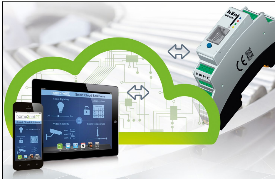
Modular solution: Flexible cloud enabled IoT controller for multiple applications