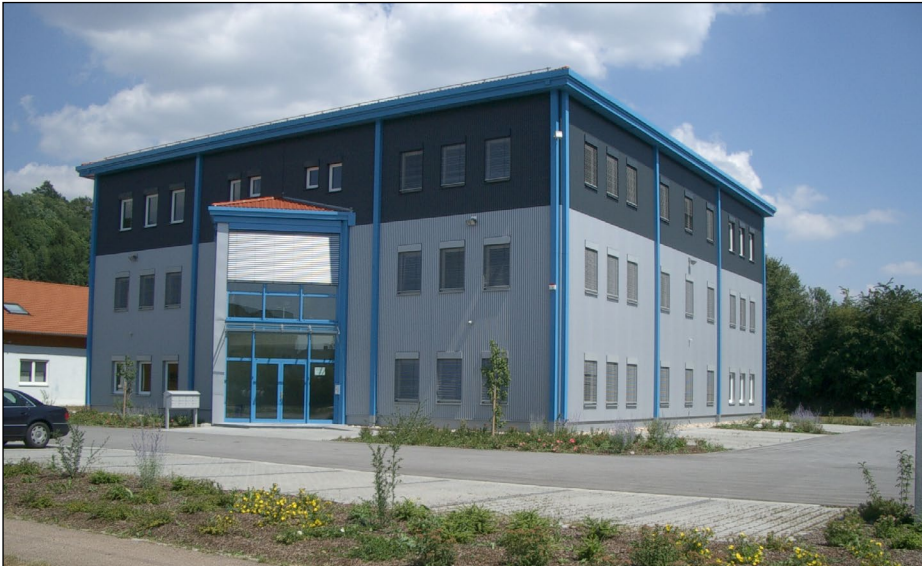
home2net development is located in Würth an der Donau, Germany