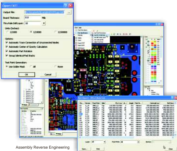
Assembly Reverse Engineering

VisualCAM will streamline your manufacturing engineering processes by eliminating costly revision spins, improving your time-to-market, and increasing your overall design quality. Visit the VisualCAM Web site today at http://www.wssi.com/visualcam , and download a trial copy that lets you take a closer look at the many features that VisualCAM has to offer, as well as evaluate VisualCAM's effectiveness on your own data.